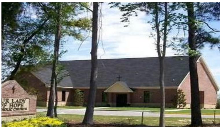
Our Lady of hope Catholic Church 2529 Raccoon Road, Manning, SC 29102

No matter what your present status in the Catholic Church. No matter what your current family or marital situation. No matter what your past or present religious affiliation. No matter what your personal history, age, background, race, or color. No matter what your self image or esteem, You are invited, welcomed, accepted and respected at St. Mary- Our Lady of Hope.