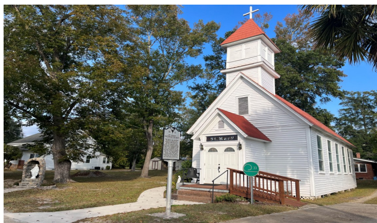
St. Mary Mission 12 N Cantey St Summerton SC 29148