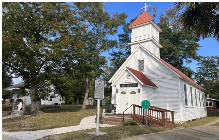
St. Mary Mission 12 N Cantey St Summerton SC 29148