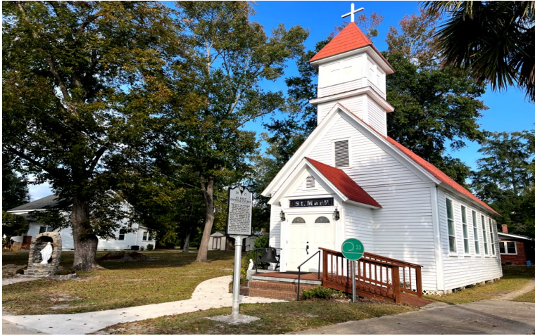
St. Mary Mission Church—Since 1914 12 N. Cantey St Summerton SC 29148