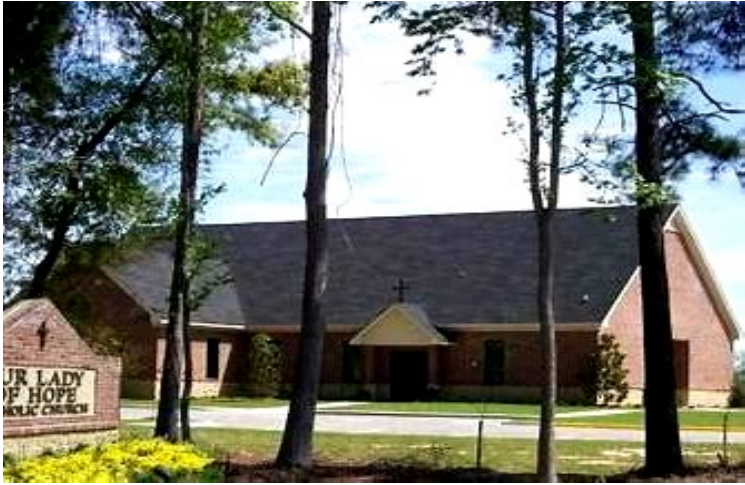
Our Lady of Hope Catholic Church 2529 Raccoon Road, Manning, SC 29102