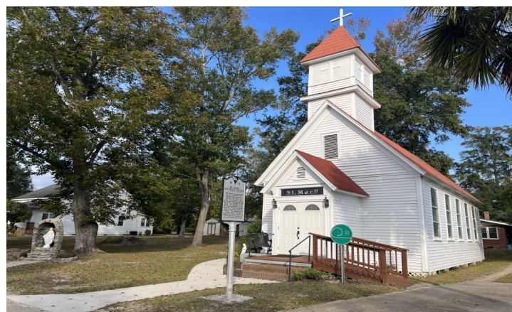
St. Mary Mission 12 N Cantey St Summerton SC 29148