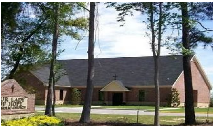
Our Lady of hope Catholic Church 2529 Raccoon Road, Manning, SC 29102

No matter what your present status in the Catholic Church. No matter what your current family or marital situation. No matter what your past or present religious affiliation. No matter what your personal history, age, background, race, or color. No matter what your self image or esteem, You are invited, welcomed, accepted and respected at St. Mary- Our Lady of Hope.