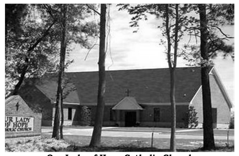
Our Lady of Hope Catholic Church 2529 Raccoon Road, Manning, SC 29102