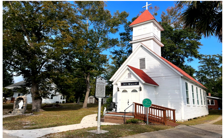
St. Mary Mission Church—Since 1914 12 N. Cantey St Summerton SC 29148