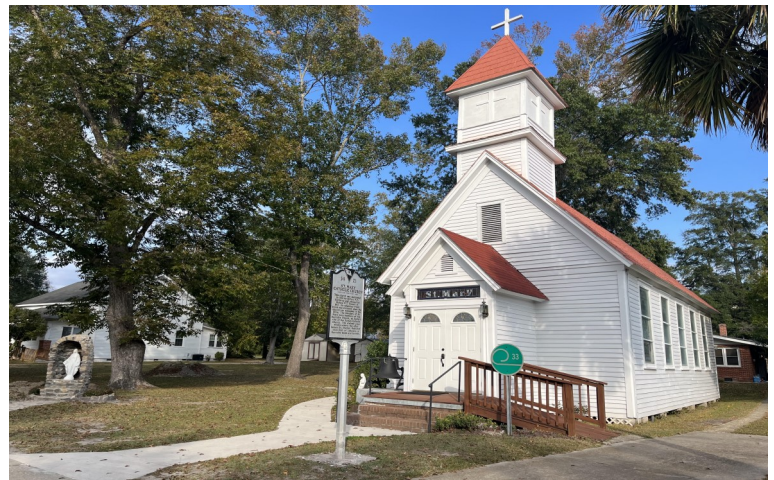
St. Mary Mission 12 N Cantey St Summerton SC 29148