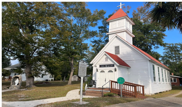
St. Mary Mission 12 N Cantey St Summerton SC 29148