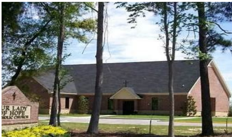
Our Lady of hope Catholic Church 2529 Raccoon Road, Manning, SC 29102

No matter what your present status in the Catholic Church. No matter what your current family or marital situation. No matter what your past or present religious affiliation. No matter what your personal history, age, background, race, or color. No matter what your self image or esteem, You are invited, welcomed, accepted and respected at St. Mary- Our Lady of Hope.