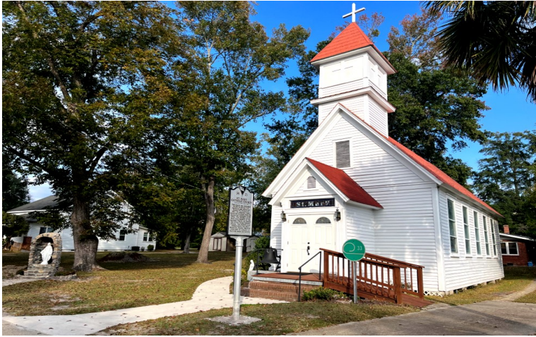
St. Mary Mission Church—Since 1914 12 N. Cantey St Summerton SC 29148