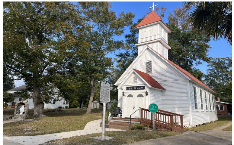
St. Mary Mission 12 N Cantey St Summerton SC 29148