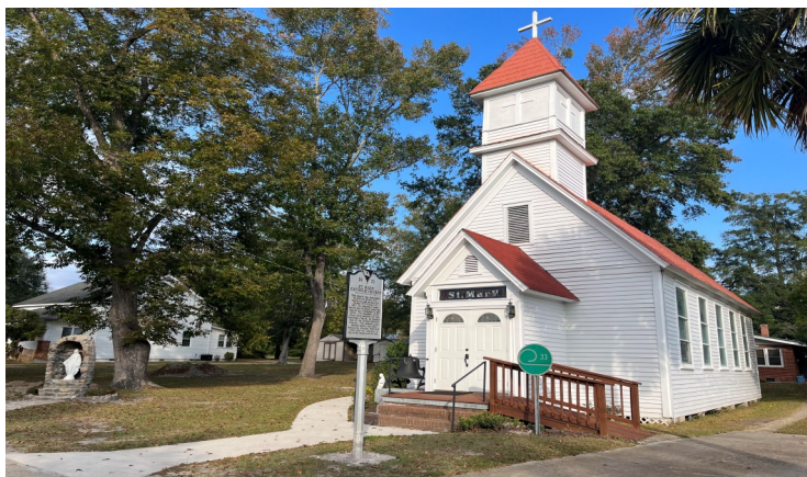
St. Mary Mission 12 N Cantey St Summerton SC 29148