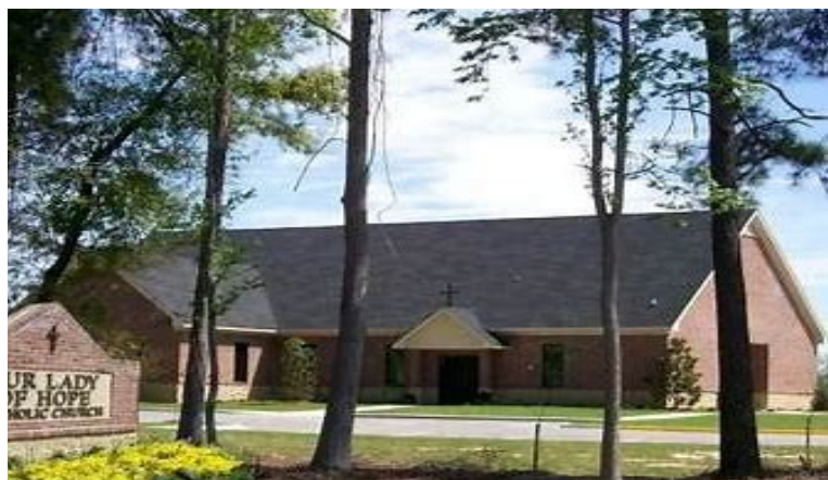
Our Lady of hope Catholic Church 2529 Raccoon Road, Manning, SC 29102

No matter what your present status in the Catholic Church. No matter what your current family or marital situation. No matter what your past or present religious affiliation. No matter what your personal history, age, background, race, or color. No matter what your self image or esteem, You are invited, welcomed, accepted and respected at St. Mary- Our Lady of Hope.