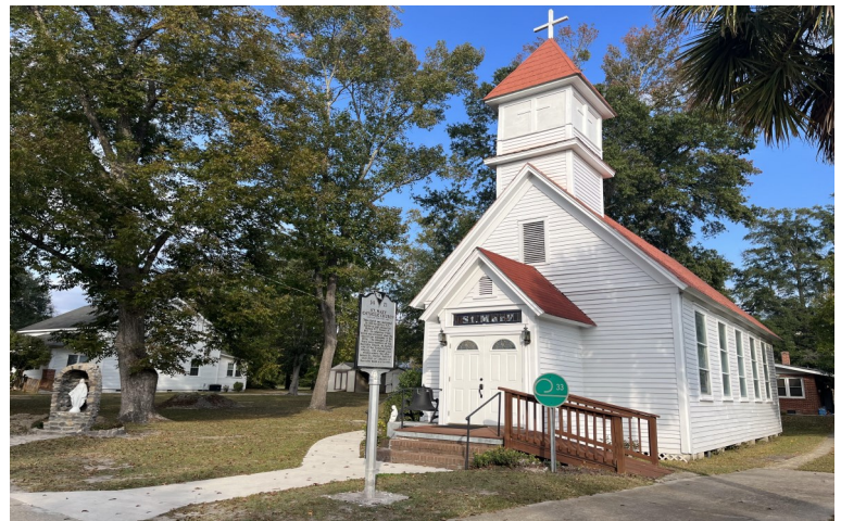
St. Mary Mission 12 N Cantey St Summerton SC 29148