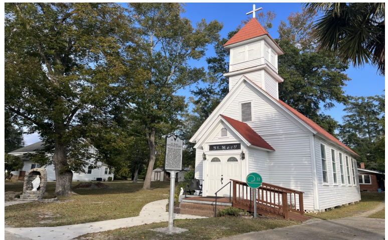
St. Mary Mission 12 N Cantey St Summerton SC 29148