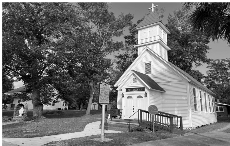
St. Mary Mission 12 N Cantey St Summerton SC 29148