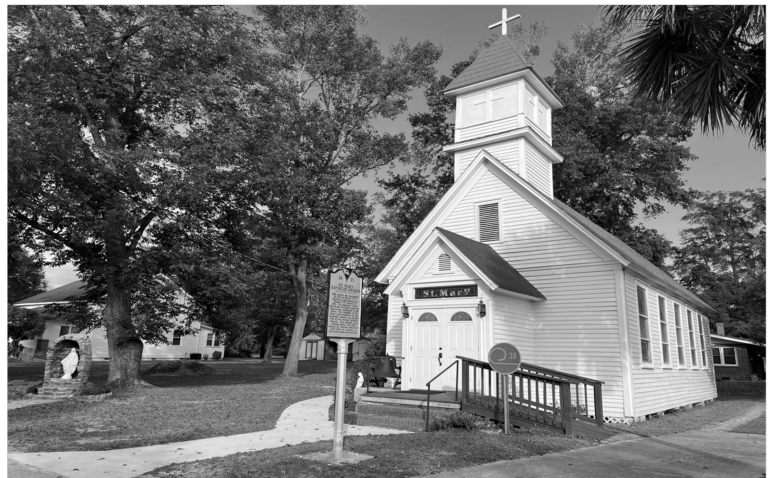
St. Mary Mission 12 N Cantey St Summerton SC 29148