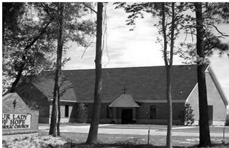
Our Lady of Hope Catholic Church 2529 Raccoon Road, Manning, SC 29102