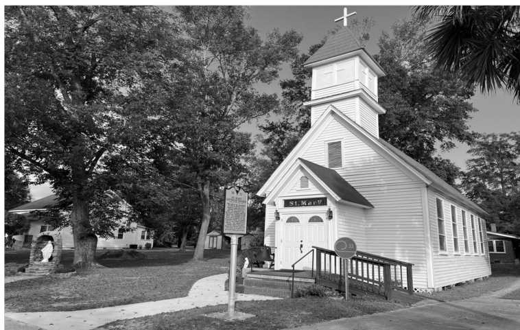
St. Mary Mission 12 N Cantey St Summerton SC 29148